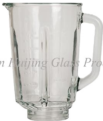
Foshan Huijing Glass Products Co.,Ltd