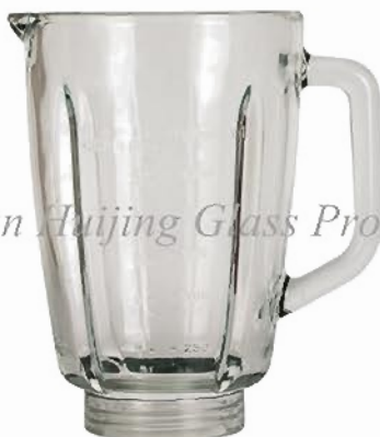
Foshan Huijing Glass Products Co.,Ltd