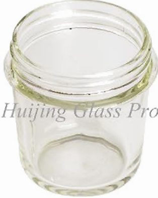
Foshan Huijing Glass Products Co.,Ltd