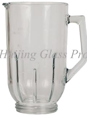
Foshan Huijing Glass Products Co.,Ltd