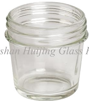
Foshan Huijing Glass Products Co.,Ltd