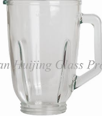
Foshan Huijing Glass Products Co.,Ltd