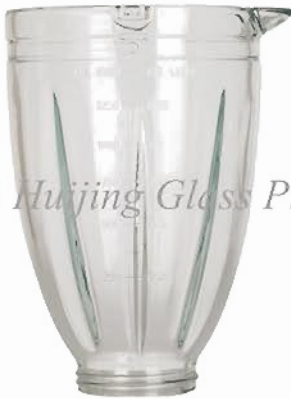
Foshan Huijing Glass Products Co.,Ltd