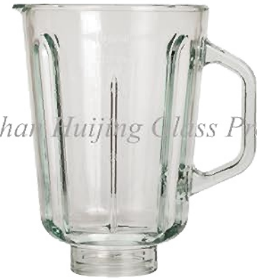
Foshan Huijing Glass Products Co.,Ltd