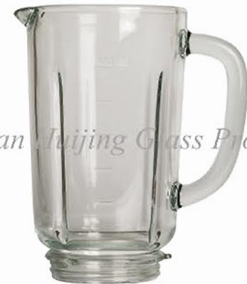
Foshan Huijing Glass Products Co.,Ltd