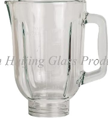
Foshan Huijing Glass Products Co.,Ltd