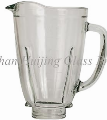
Foshan Huijing Glass Products Co.,Ltd