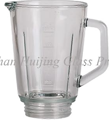
Foshan Huijing Glass Products Co.,Ltd