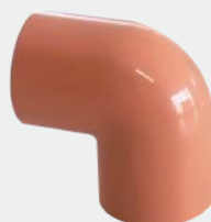
90 DEG ELBOW

SIZE: 3/4", 1", 1-1/4", 1-1/2", 2", 2-1/2", 3"