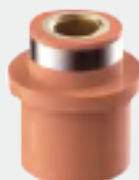
SPRINKLER ADAPTOR (BRASS)

SIZE: 1"X1", 1-1/4"X1-1/4", 1-1/2"X1-1/2", 2"X2