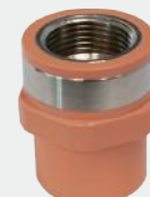
FEMALE ADAPTOR (BRASS)

SIZE: 1"X1", 1-1/4"X1-1/4", 1-1/2"X1-1/2", 2"X2