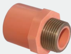
MALE ADAPTOR (BRASS)

SIZE: 1"X3/4", 1-1/4"X3/4", 1-1/4"X1", 1-1/2"X3/4", 1-1/2"X1", 1-1/2"X1-1/4", 2"X3/4", 2"X1", 2"X1-1/4", 2"X1-1/2", 2-1/2"X1", 2-1/2"X1-1/4", 2-1/2"X1-1/2", 2-1/2"X2", 3"X2", 3"X2-1/2"