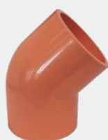
45 DEG ELBOW

SIZE: 3/4", 1", 1-1/4", 1-1/2", 2", 2-1/2", 3"